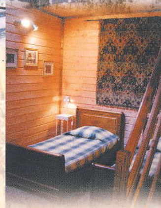
The "Ferme Bonne de la Grotte" welcomes you throughout the year. In all seasons, discover the massif of Chartreuse, its hikes, its skiable slopes, its heritage and its culture. From its Carthusian architecture, the legacy of the Carthusian monks, to its small, rural, straggling villages, the Charterhouse offers you its spaciousness of calm and beauty.

Savour the charm of this 17th Century residence, which has crossed through time and history, imprinted with aserene beauty, belonging to the masters of these surroundings.