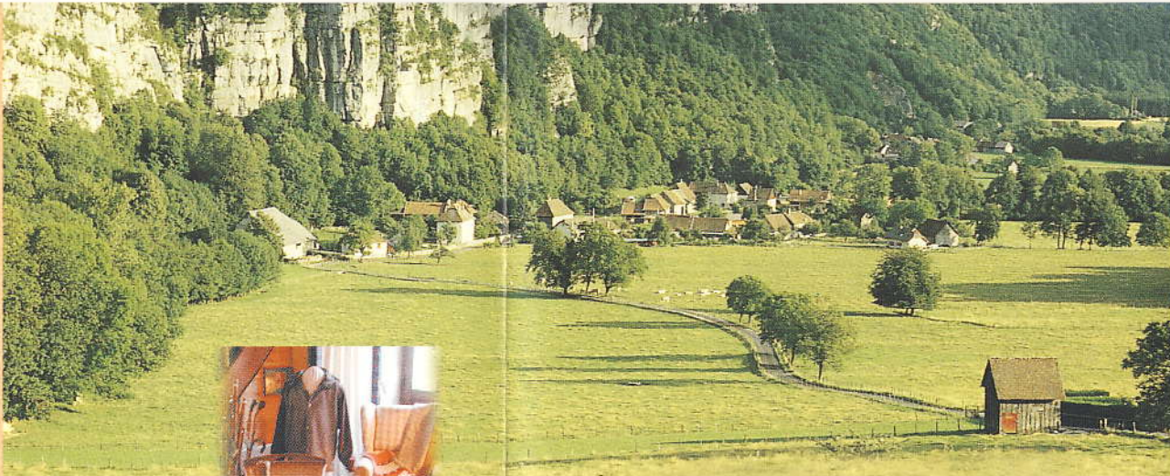
The village of St Christophe la Grotte, blotted at the foot of rocky cliffs for moments of tranquillity and freedom at the heart of the Chartreuse regional Nature Reserve.